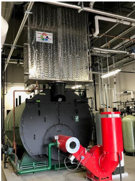
Figure 1 BEI SPLIT-TITAN STK MODEL TWO-STAGE ECONOMIZER

Two-stage technology provides further improvement in boiler efficiency by adding a second stage, usually condensing, after the first stage into a common casing for both heat exchanger sections. The second stage water flow very often tends to be boiler make-up water or a process water stream. Since the second stage usually enters the economizer at a temperature well under the dew point both a sensible and latent heat recovery can be realized resulting in far greater efficient gains. Modern two-stage economizers can provide efficiency gains in the 5% to 12% depending on the temperature and volume of the second stage heat sink.